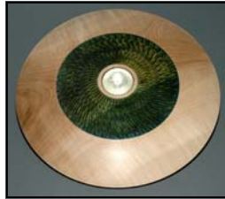
Gold Leaf insert