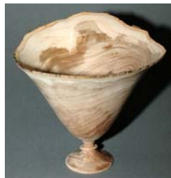
End grain vase to be raffled at the October meeting