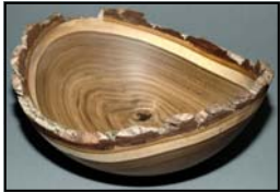
Natural edge bowl

The raffle of the first Jimmy Clewes walnut lidded box at the September meeting was fun. The tickets are $1 each or 6 for $5. For the next meeting we will be raffling of the end grain vase. These other items will be coming up in future meetings. If you cannot get to the meeting for the raffle, contact Ken Emerson to purchase your tickets in advance.